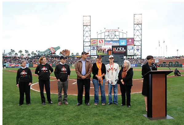
CCHAS staff at San Francisco Giants Game