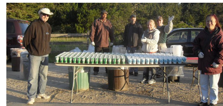
CCHAS Volunteers at the 2011 Big Sur Marathon